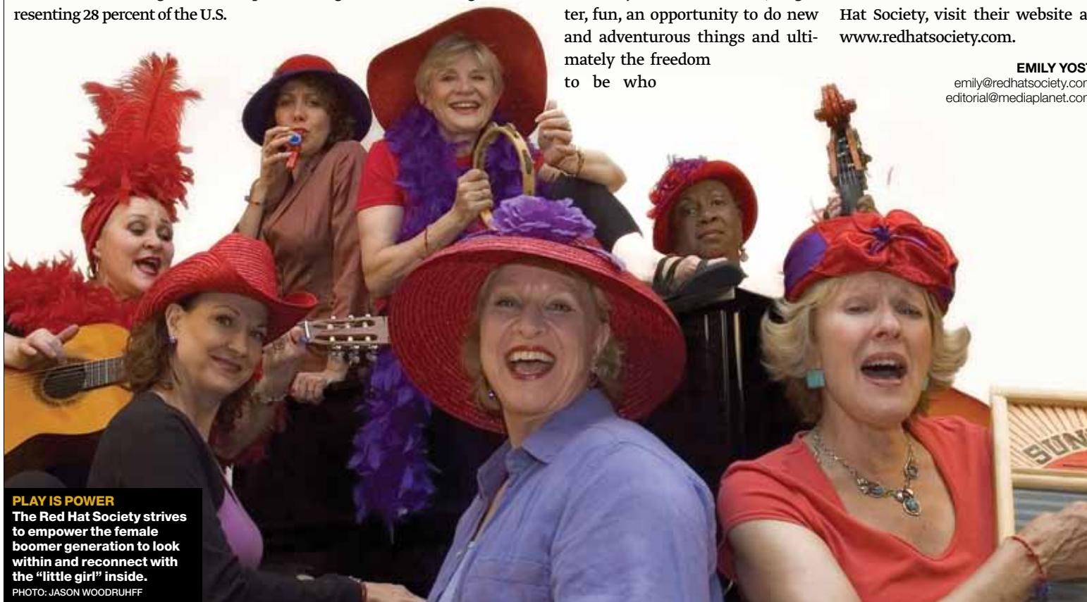
PLAY IS POWER The Red Hat Society strives to empower the female boomer generation to look within and reconnect with the “little girl” inside.

emily@redhatsociety.com editorial@mediaplanet.com