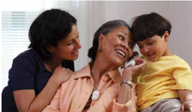
SUPPORTIVE CARE. With longer life expectancies, older children are assuming the role of caregiver for their elderly parents.

“As the population in the U.S. ages, the prevalence of chronic disease, disability and dependency will also