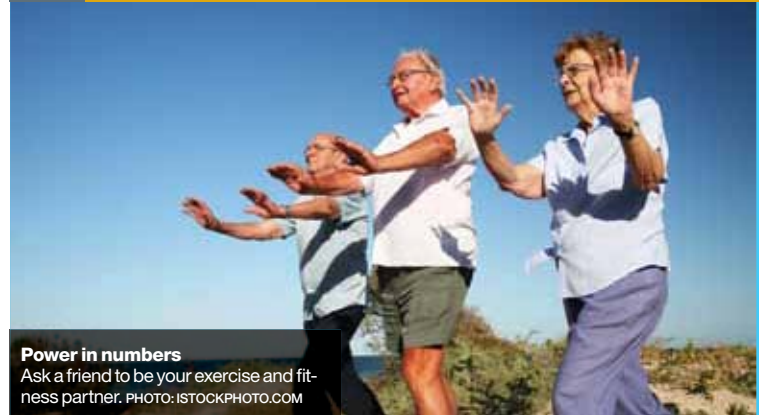
Power in numbers Ask a friend to be your exercise and fitness partner.