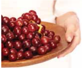
Resveratrol can be found naturally in grapes, some green teas, and even peanuts.

ity to increase energy, improve concentration, assist in weight loss, and improve athletic endurance without side effects has made it a fast growing supplement. Thus far, most studies have been on animals, however