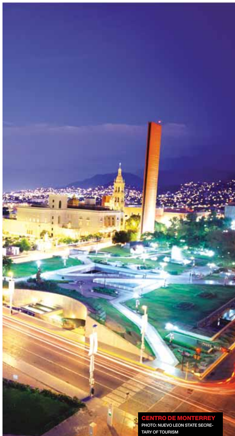
CENTRO DE MONTERREY